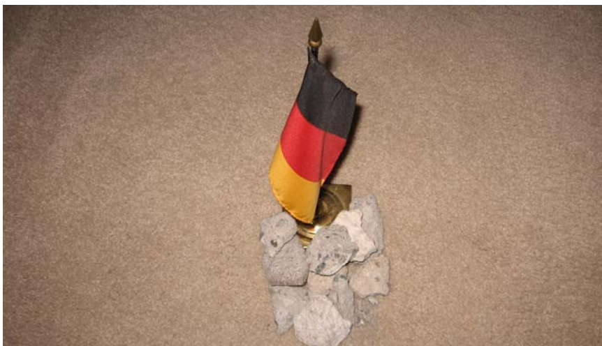
Berlin Wall, taken down in 1989 and 1990

The next meeting will be September 8 at the USA Family Restaurant, North Main St., Monticello, at 11:30. Everyone, including those without AARP cards, is invited.