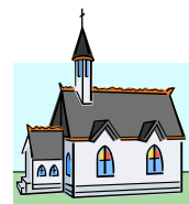
The friendly church at the side of the road!